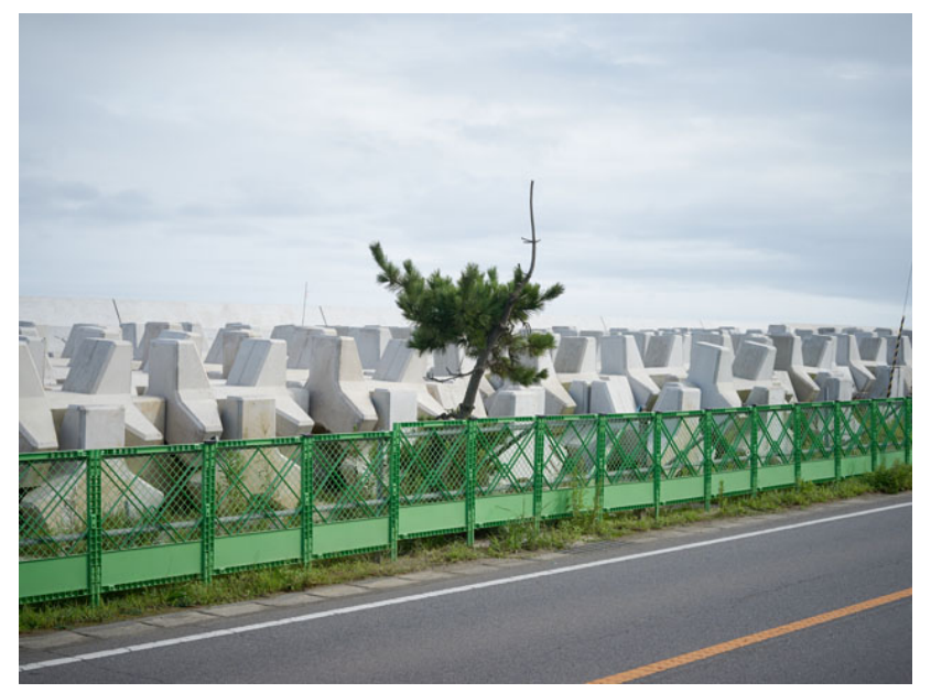
Toshiyuki Nanjo shelterbelt inkjet print 2016