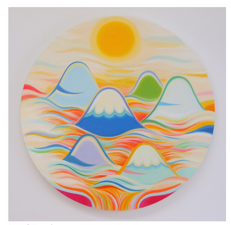
Kaori Tanaka Moonlight, Mountains, and Waters oil on canvas 60x60cm 2017

Yuna Ogino p 130917_1 oil on canvas 91x91cm 2017