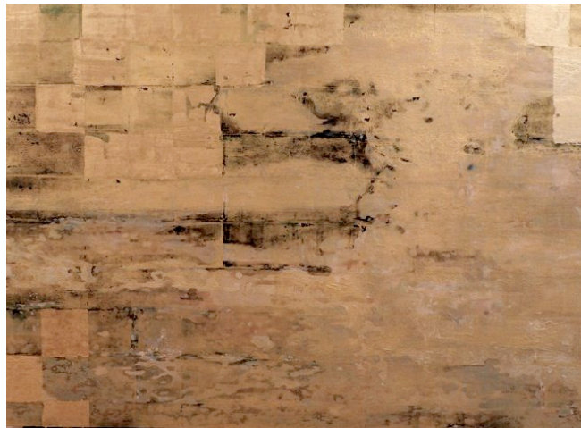
야수키 마사코 "exposed scape - a collective memory" glue, pigment, Paris white, gold leaf on wooden panel, hemp cloth and Bolognese chalk