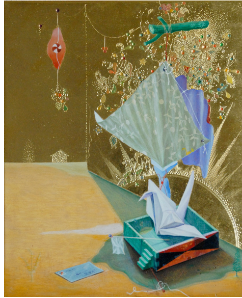
송 중덕 "Space for Reminiscence" tempera, gold leaf on panel 19×22.5cm