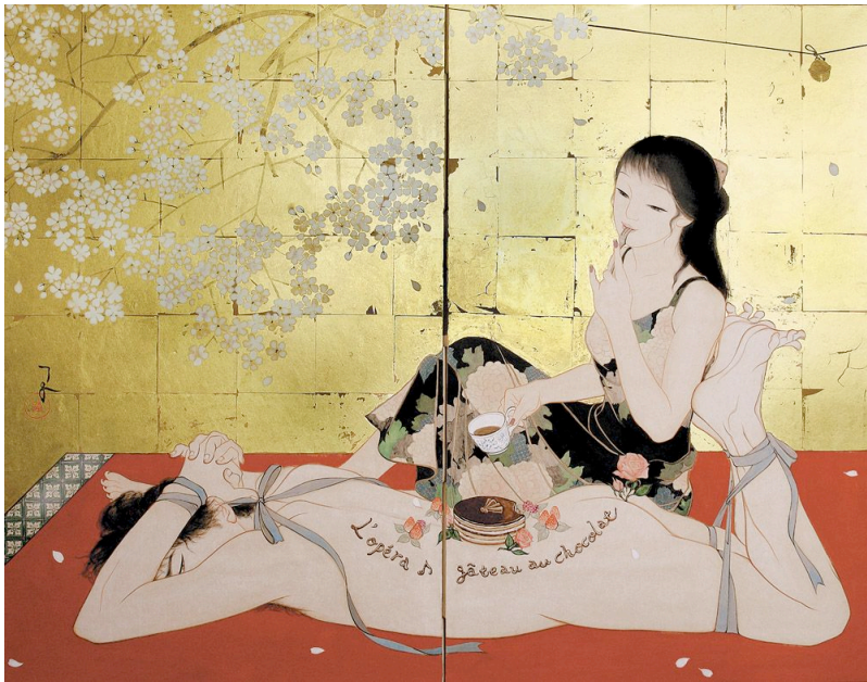
키무라 료우코 "Dessert / A man's body dish for L'opera gateau au chocolat" Japanese pigment, gold leaf on paper (standing screen) 120×97cm 2005