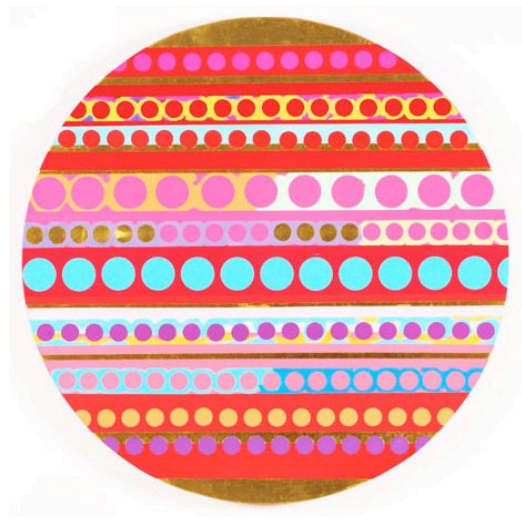
박 현주 "MA-UM" gesso, acrylic, gold leaf on panel 60×60cm 2009