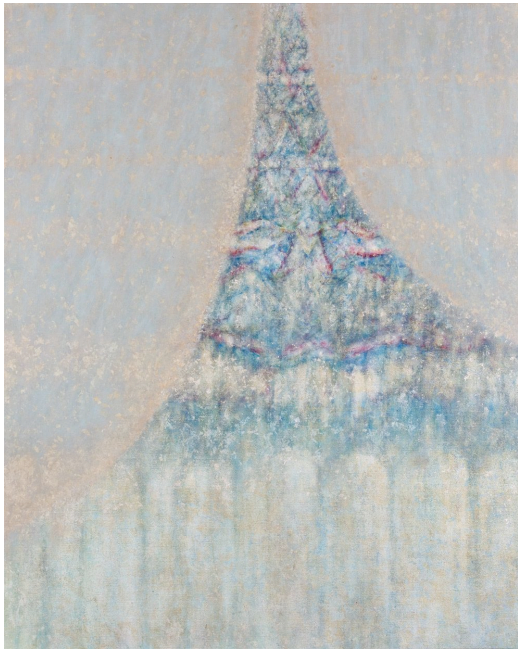
시라카와 노리요리 "V - C - Light - 2010" chalk, silver leaf, tempera, oil on canvas 100×80.3cm 2010