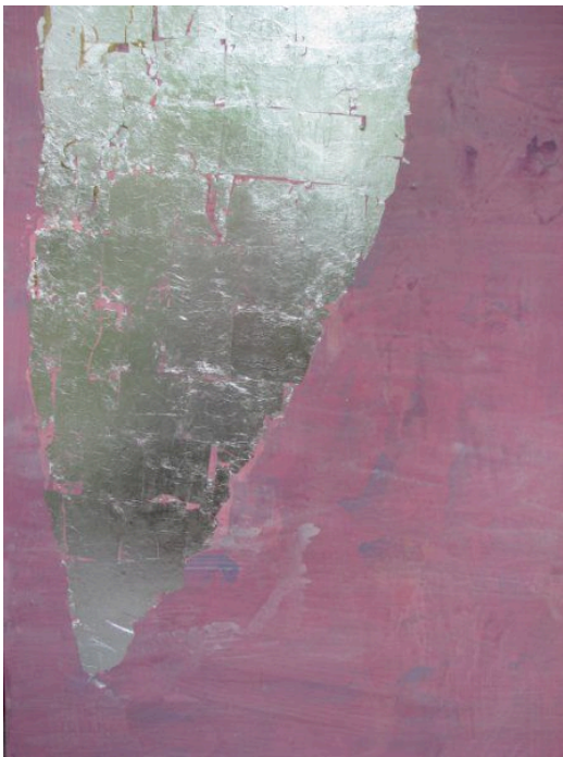
이정은 "Whenever it may be, we shall meet again" acrylic, pearl pigment, binder, silver leaf on canvas 130.3×97cm 2007