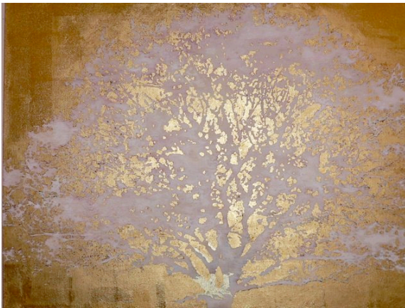
야수키 마사코 "exposed scape - a childhood tree" glue, pigment, Paris white, gold leaf on wooden panel, hemp cloth and Bolognese chalk 68×90cm 2010