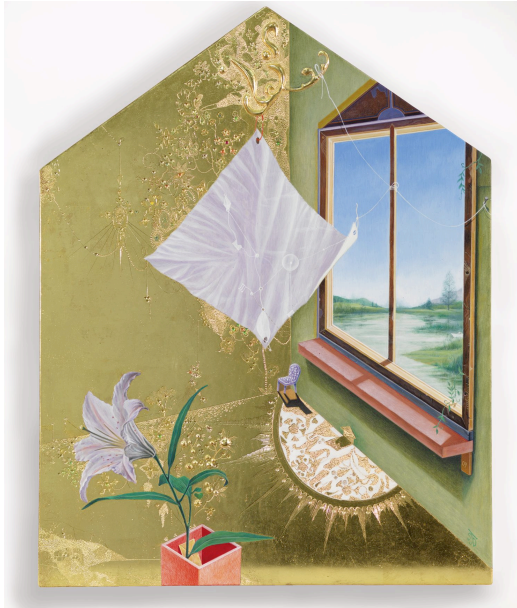
송 중덕 "Space for Reminiscence" tempera, gold leaf on panel 16.2×20.7cm