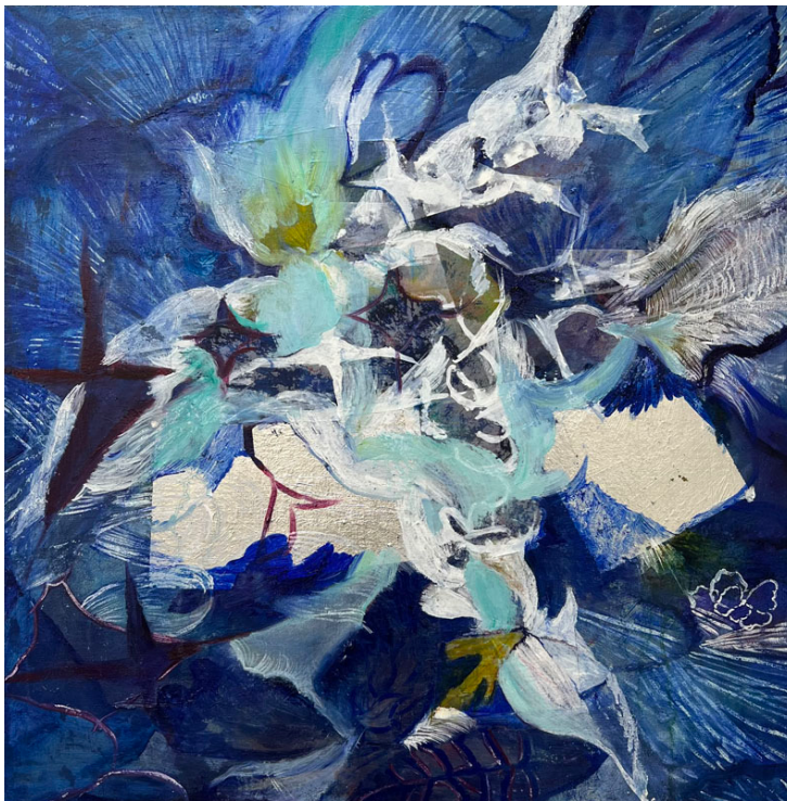
Natsumi Nanashino good blue (nightjar star) oil, tempera, aluminum leaf on canvas 72.7x72.7cm 2024