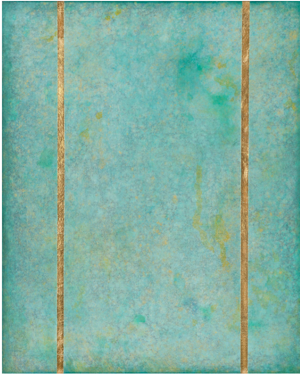
Hyunjoo Park Light Between pigment, gold leaf on canvas 65.1x53cm 2022