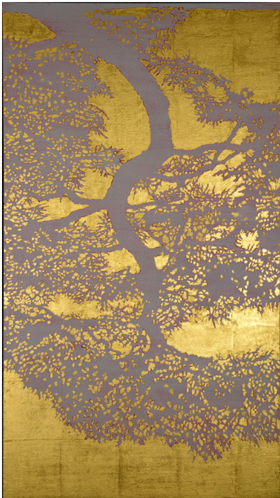
Masako Yasuki Pine Tree (Silent Reflections) gold leaf, pigment on wooden panel, hemp cloth, Gesso Bologna 90x50cm 2022