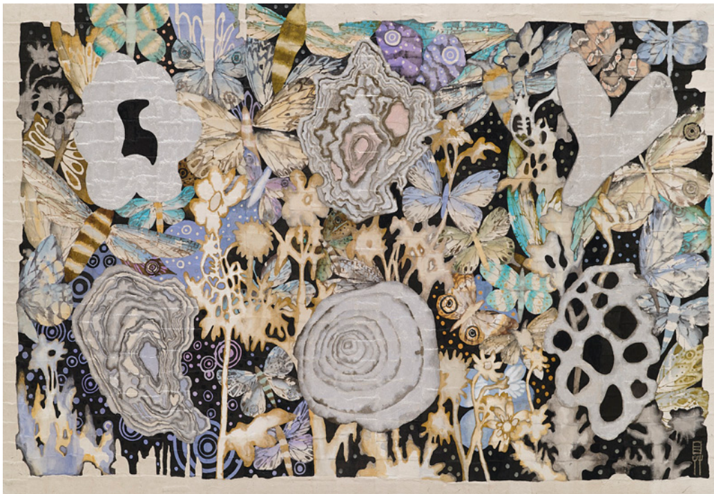
Bona Koo Co-evolution 2 ink, pigment, gold powder, silver powder on Korean paper (collage) 96.5x66cm 2022