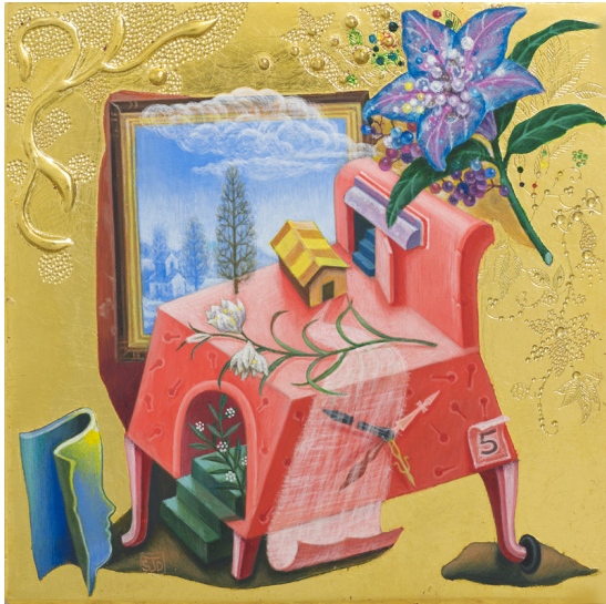
Jungduk Song Space for Reminiscence tempera, gold leaf on wood 12.5x12.5cm 2022