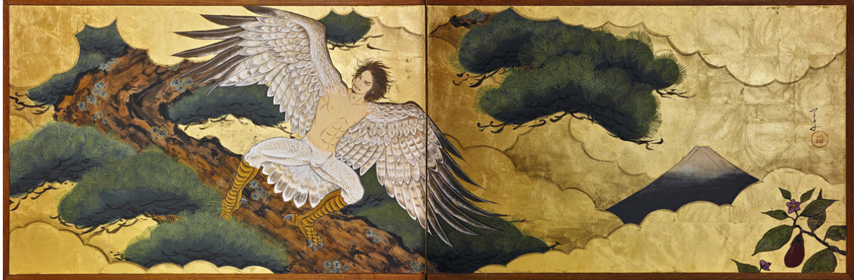
Ryoko Kimura Happy Dream of the Year pigment, gold leaf on paper (two-panel folding screen) 60.5x180cm 2016