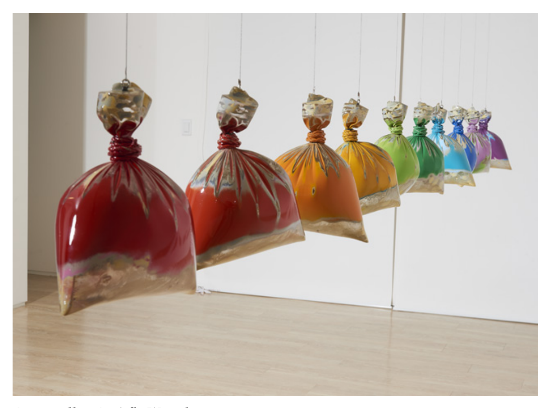
Artactually - Anti-fly Waterbag resin, urethane, rope, clothesline 25x15x25cm 2018