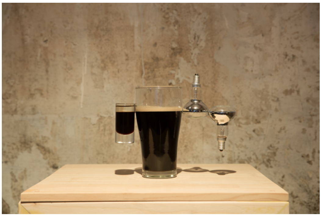
There Is No Reason Guinness, balsamic vinegar, olive oil, bulb, glass 22x8x13cm 2012