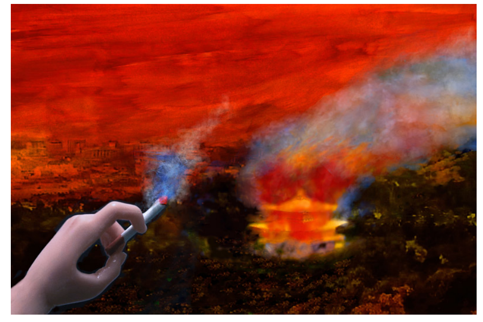
The Temple of the Golden PavilionC-print27.5x41.1cm2022