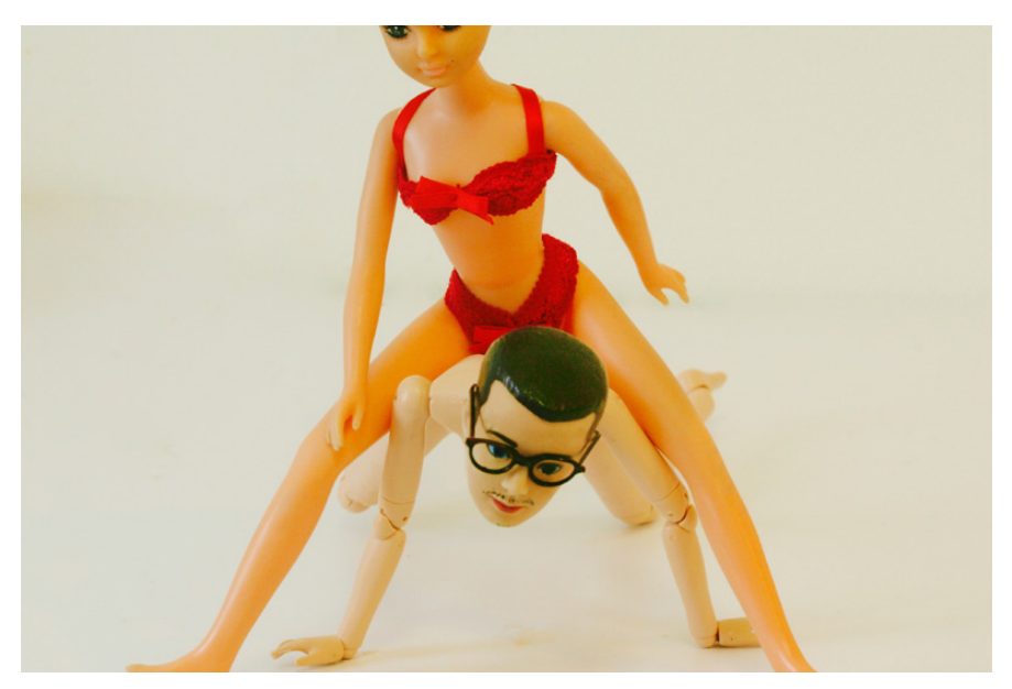
Naomi, the Heroine of Jun'ichiro Tanizaki's 'Naomi' C-print 20x28.5cm 2015