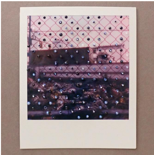
Ayako Kurihara Landscape in a Grid - Honmoku Pier acrylic, Polaroid film 8.8x10.8cm 2023