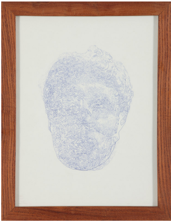
Hyungwan Kim Untitled 2 carbon paper drawing on paper 32x24cm 2005