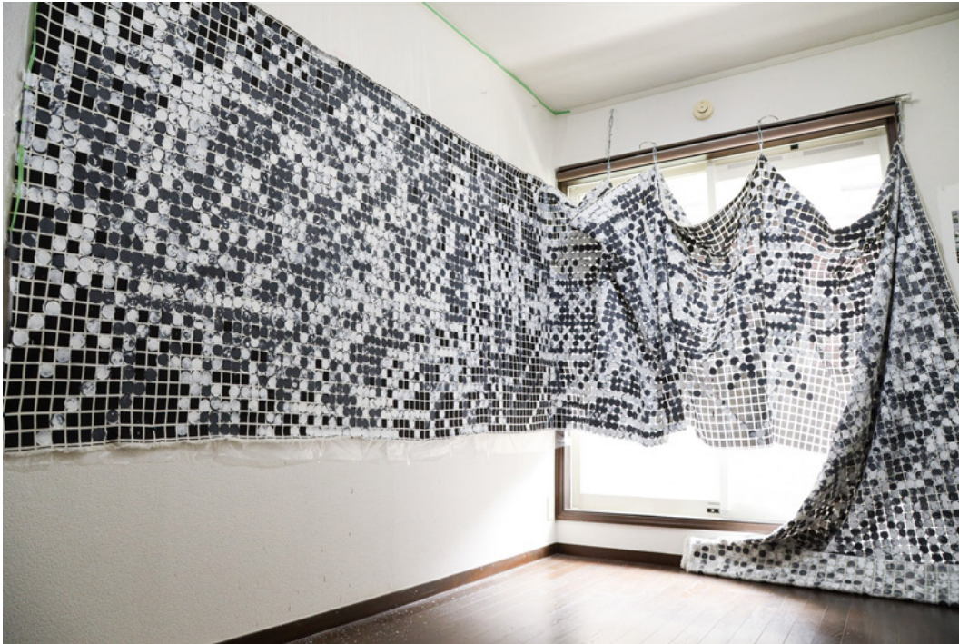
Mind Games 'I Am Here'