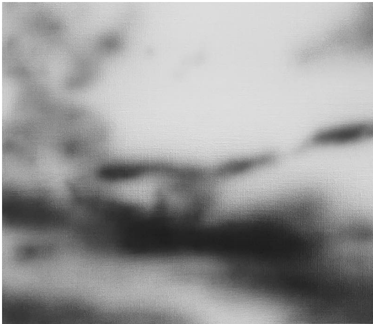
Out of Frame