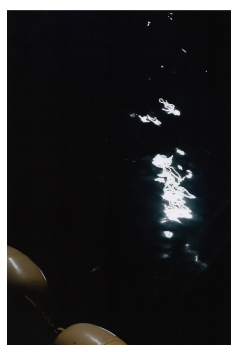
suns-91 C-print 43×35cm Ed.5 2014