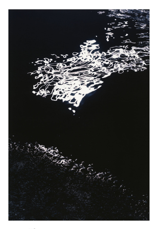
suns-73 C-print 50×35cm Ed.5 2012