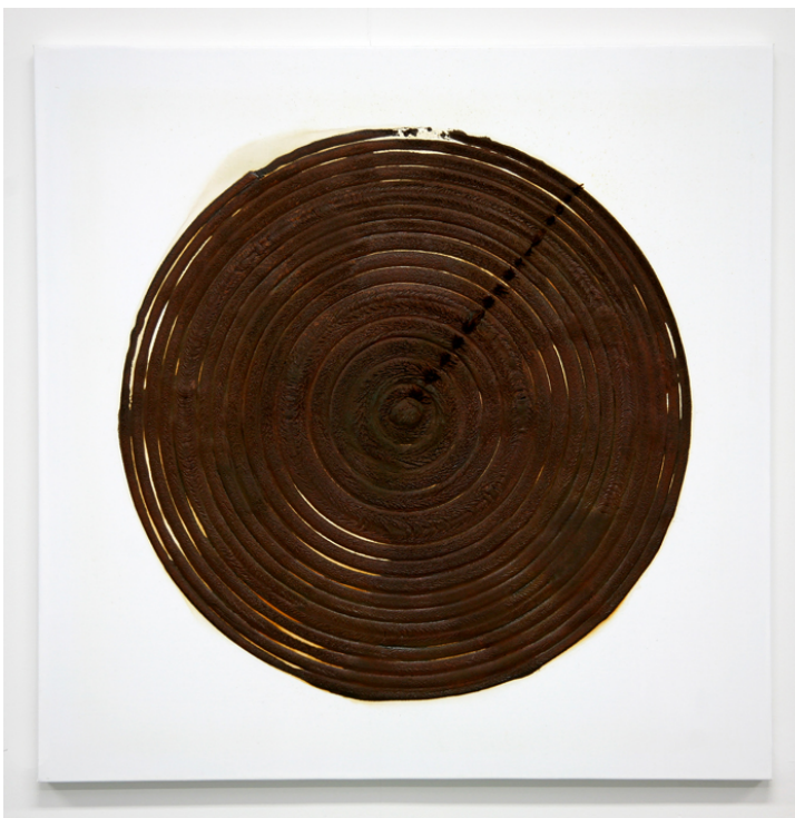
Chaotic Cosmos 02

iron powder, wood glue on canvas 80.3x80.3cm 2017