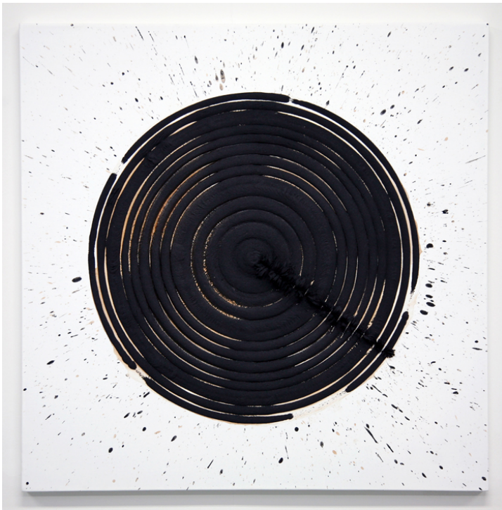
Chaotic Cosmos 01

iron powder, wood glue on canvas 80.3x80.3cm 2017